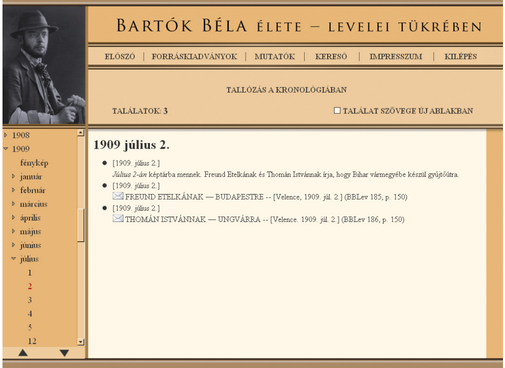
FIGURE 3. Looking up a date (2 July 1909) on the CD-ROM of Bartók letters

Based on our experience with this CD-ROM, a database has been planned for the composer's entire known correspondence. This database should be built out of the excel table and should also cumulatively unite the documents themselves: digitised copies from editions, facsimiles and transcriptions. Our aim is furthermore to make all letters whose text is included searchable. For this reason we will use texts from the highly varied sources available at the moment, including the digitised version of the two letter volumes, the typed texts of the