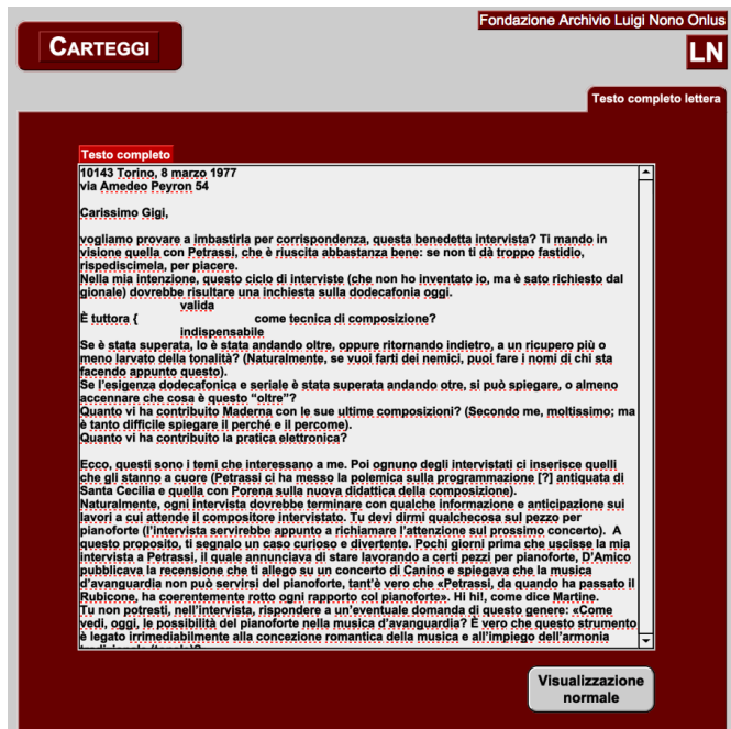
FIGURE 3. Letter from Mila to Nono, 8 March 1977: catalogue record, transcription (Venezia, Fondazione Archivio Luigi Nono, Carteggi catalogue)